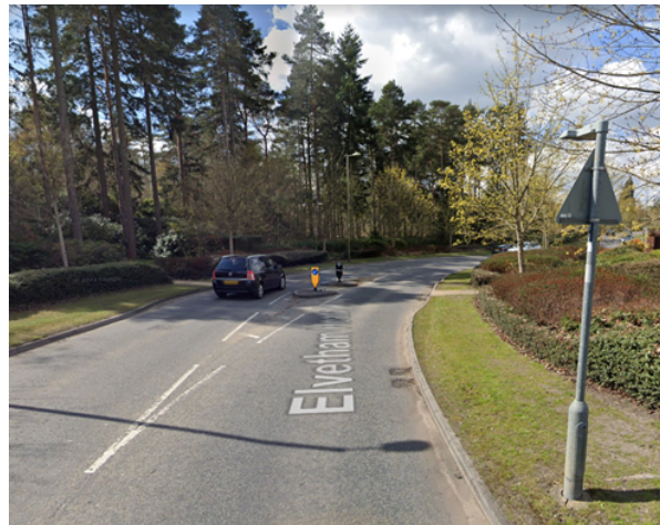
Looking west along Elvetham Heath Way with the site to the left and centre of view