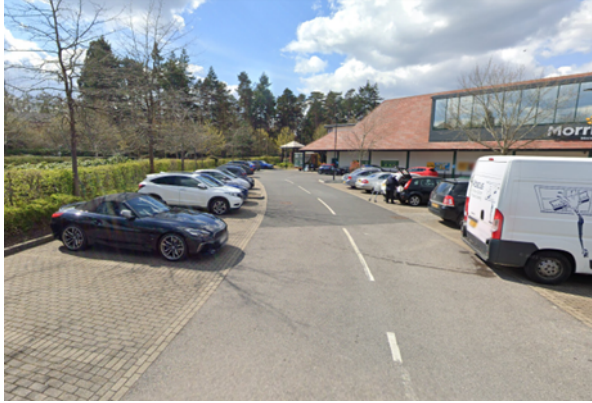
Looking west from the supermarket car park