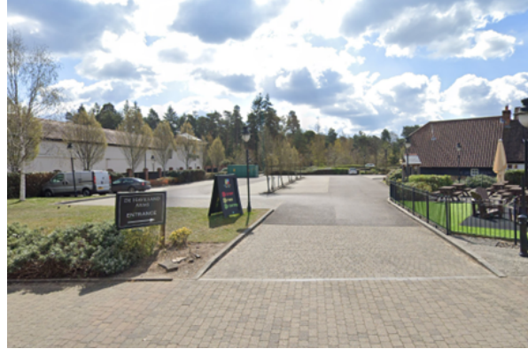
Looking south from The Keys (community centre behind)