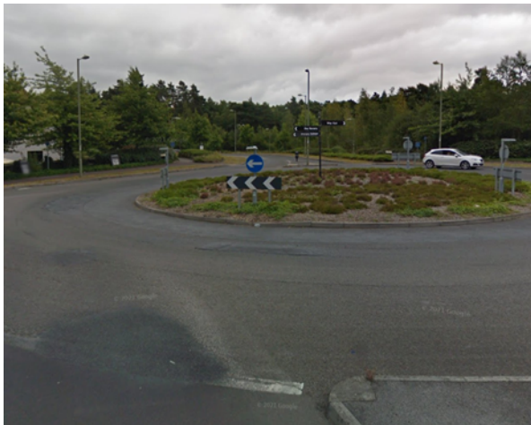
Looking east along Elvetham Heath Way